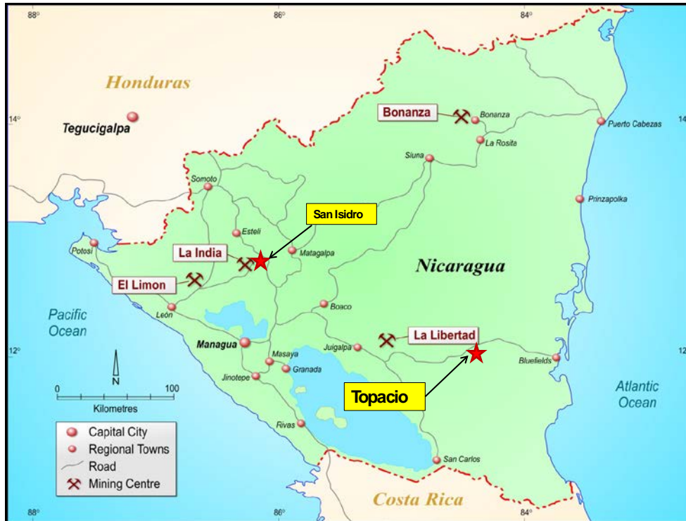
Figure 1 Major Nicaraguan gold deposits and the Topacio Gold Project (Central America)