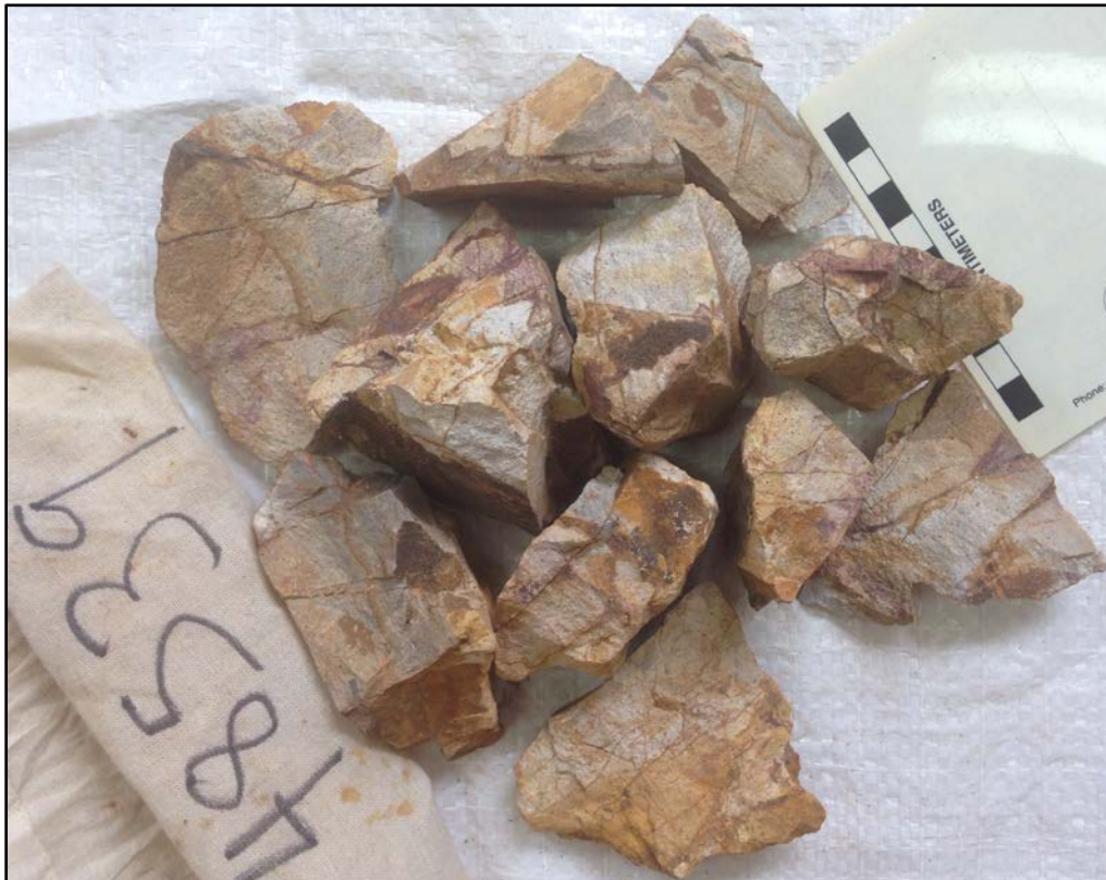
Figure 5 Buena Vista: Sample 48539 – Silicified volcanics with quartz veinlets (3.35g/t Au)

Sampling at the Antonio Diaz vein also returned anomalous values up to 0.38g/t Au (Table 1) but initial results from the El Delirio location indicate that more work is required to identify the mineralised vein referred to in historical reports.