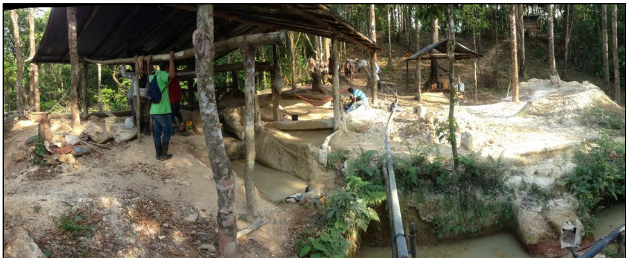
Figure 4 West Mico – Artisanal processing of gold ore