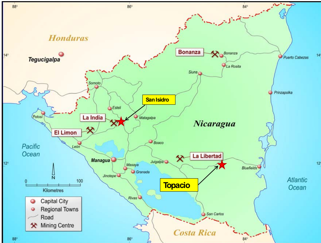
Figure 1 Major Nicaraguan gold deposits and the Topacio Gold Project (Central America)