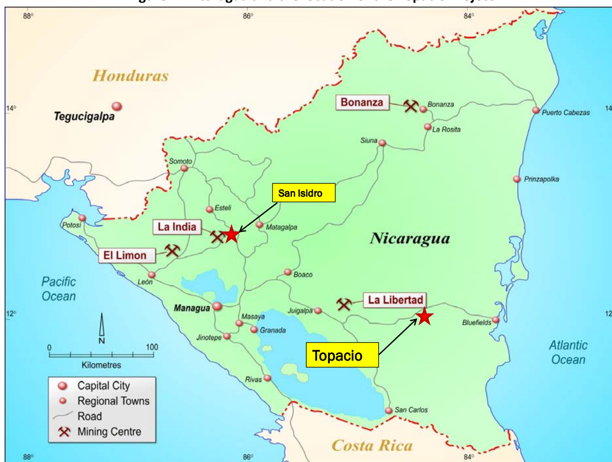
Figure 1: Nicaragua and the location of the Topacio Project

The project is located in the South Atlantic Autonomous Region in south east Nicaragua (see Figure 1) which has a hot, humid, tropical climate with a pronounced wet season (May-December) and a short dry season (January-April). Relief in the concession area is modest ranging from 80 to 500 metres above sea level and is principally rolling hills covered by cattle pastures and secondary growth tropical forest. Access is excellent with paved Highway 7 to within 3 km of the main area of drilled resources in the concession.